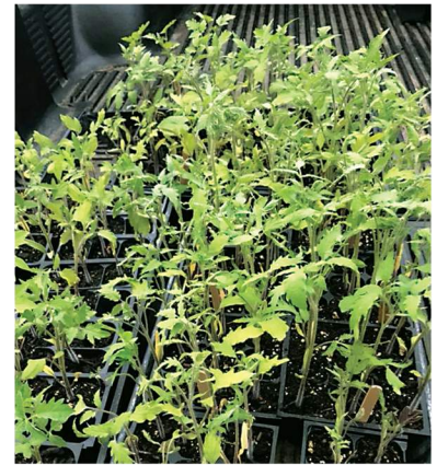
Donated tomato plants!

Everyone wants good things. To eat, to wear, to drive or to ride in. This gift came in the form of tomato plants, grown by a family to share with their neighborhood.