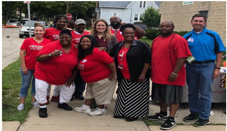
Volunteers, Staff, and Board President at the Friedens Community BBQ at Northcott Neighborhood Center, July 2018