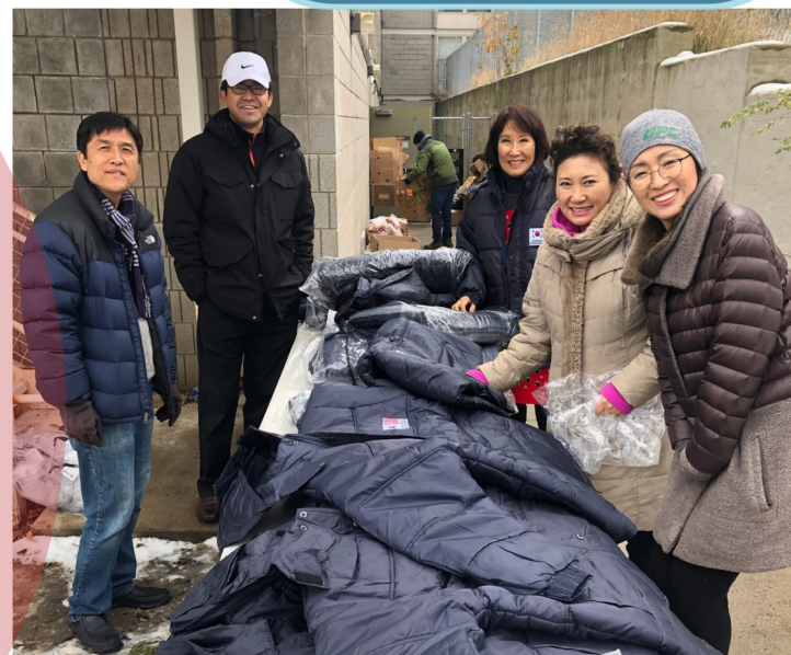
Volunteers from Life Creek Church collected coats and passed them out at Despensa. Thank you!